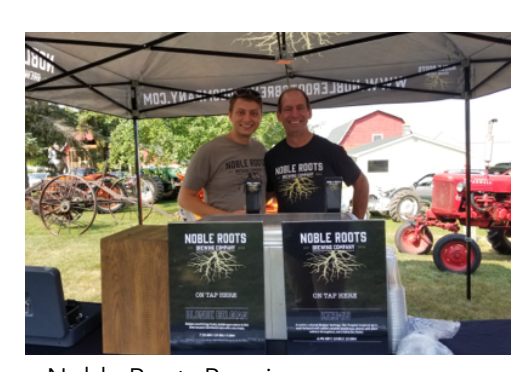
Noble Roots Brewing